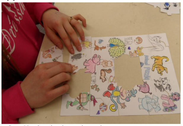
Grace Nagel putting the puzzle together